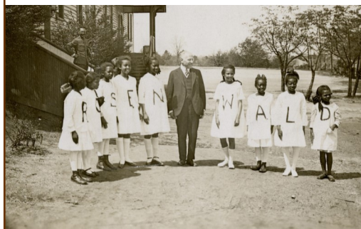
Julius Rosenwald with students from a Rosenwald school.