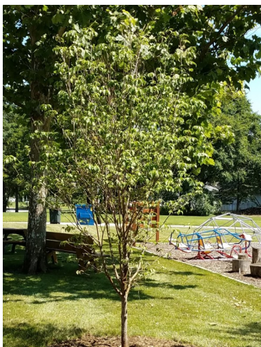
Pink Dogwood by the playground