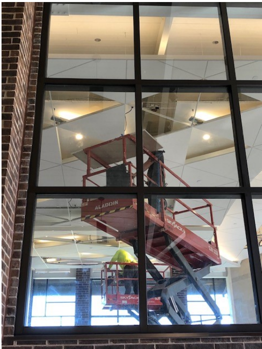
Ceiling of the sanctuary