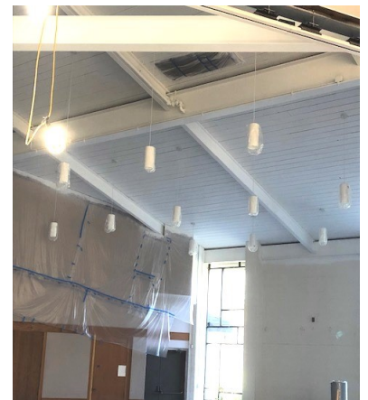
New pod lights