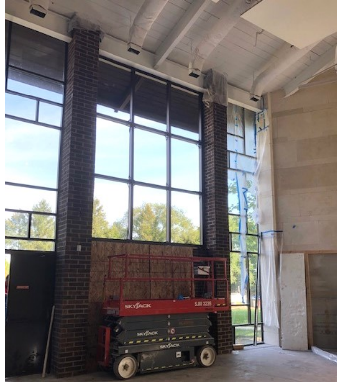
North wall of the sanctuary