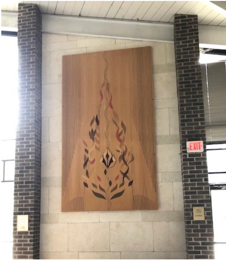
Old ark doors on the Levin Lounge east wall