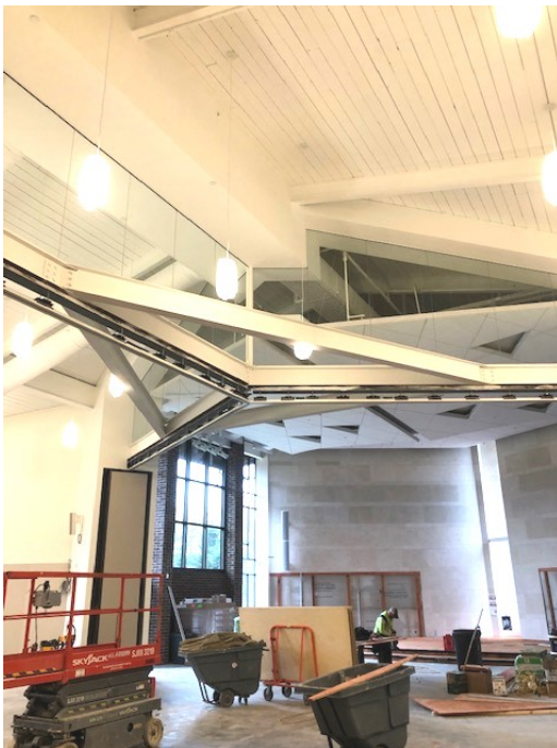
Pod lighting and partition glass