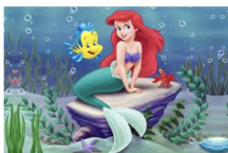
THE LITTLE MERMAIDELE

Please RSVP at https://sinaitemplecu.shulcloud.com/form/Purim.html